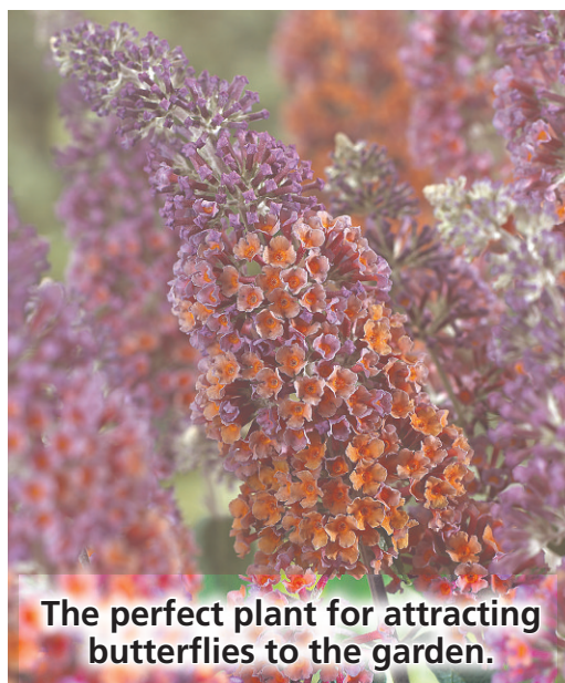
The perfect plant for attracting butterflies to the garden.

BY POST TO: The Courier Offer CA169, J. Parker Dutch Bulbs (W/S) Ltd, 14 Hadfield Street, Old Trafford, Manchester, M16 9FG